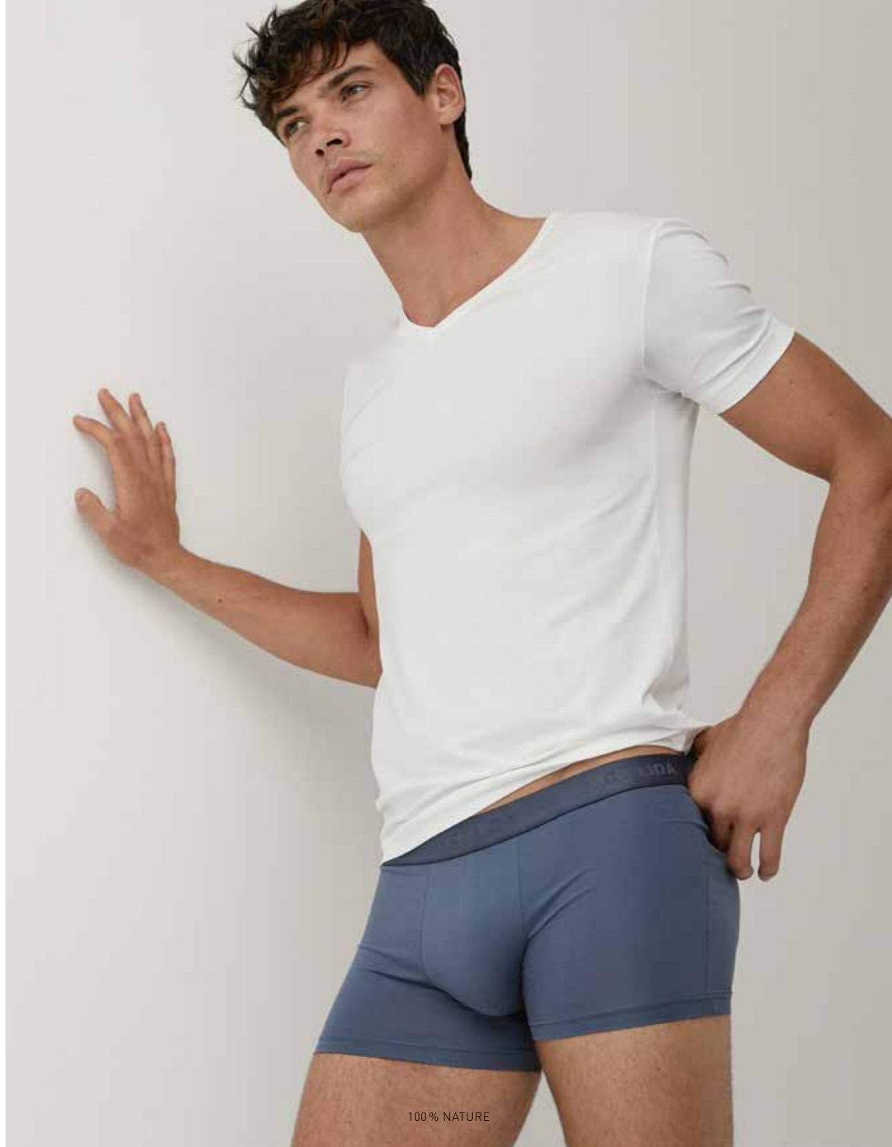
100 % NATURE