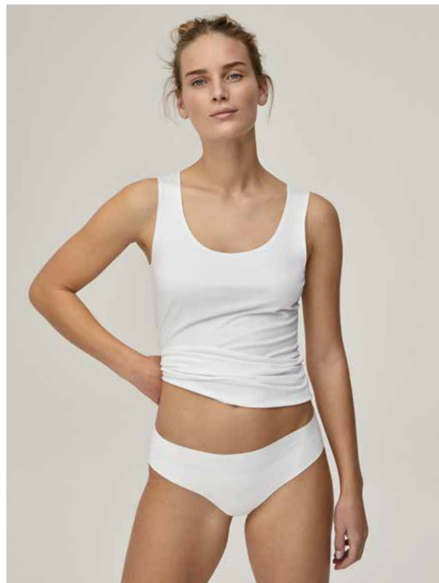
NATURAL LUXE | SILHOUETTE