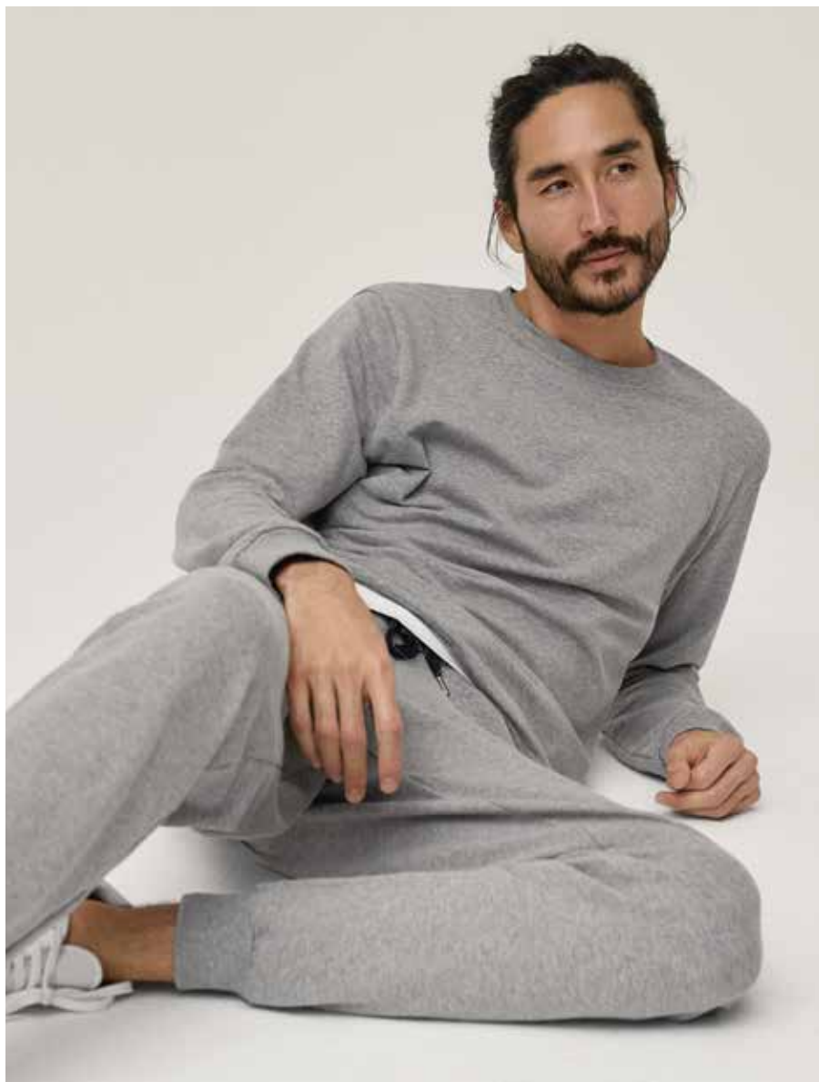
REMIX BASIC LOUNGEWEAR